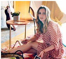
Leighton Meester's Photo Diary is a 70s Dream Jimmy Choo on Red