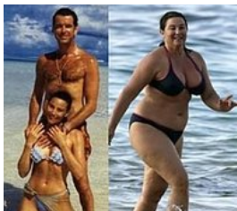
14 Celebs Who Are Aging Horribly Slick Americans