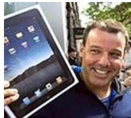
How New iPads are Selling for under £30 Money Expert

Get our hottest stories delivered to your inbox.