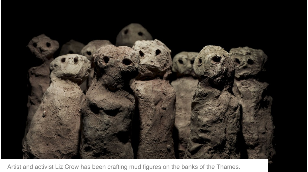
Artist and activist Liz Crow has been crafting mud figures on the banks of the Thames.