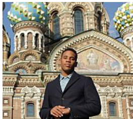
Racism, Gay Rights & Teen Models. Reggie Yates goes to Russia BBC Three