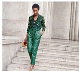
From J.Crew: Why French Women Are So Chic J.Crew