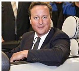
Power steering: What cars do our political leaders drive? The Express